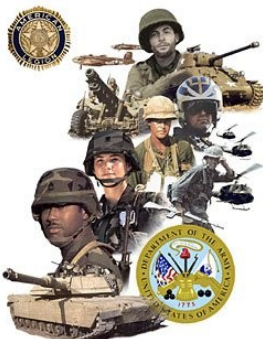
Thank You For Serving

Again, it has been a great honor to serve you this year and I look forward eagerly to the challenges of next year. For God and Country